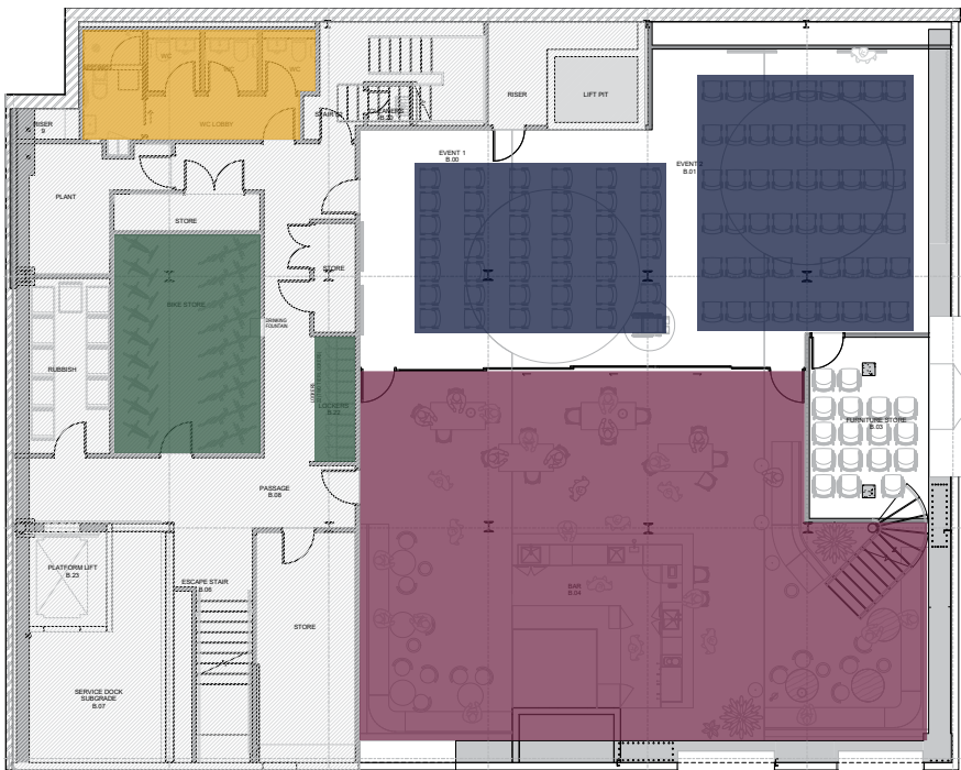
Basement Members Bar, Lounge & Event Space