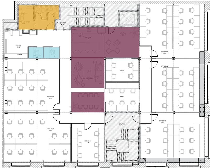
Level 1 Shared Working, Private Offices, Kitchen & Breakout