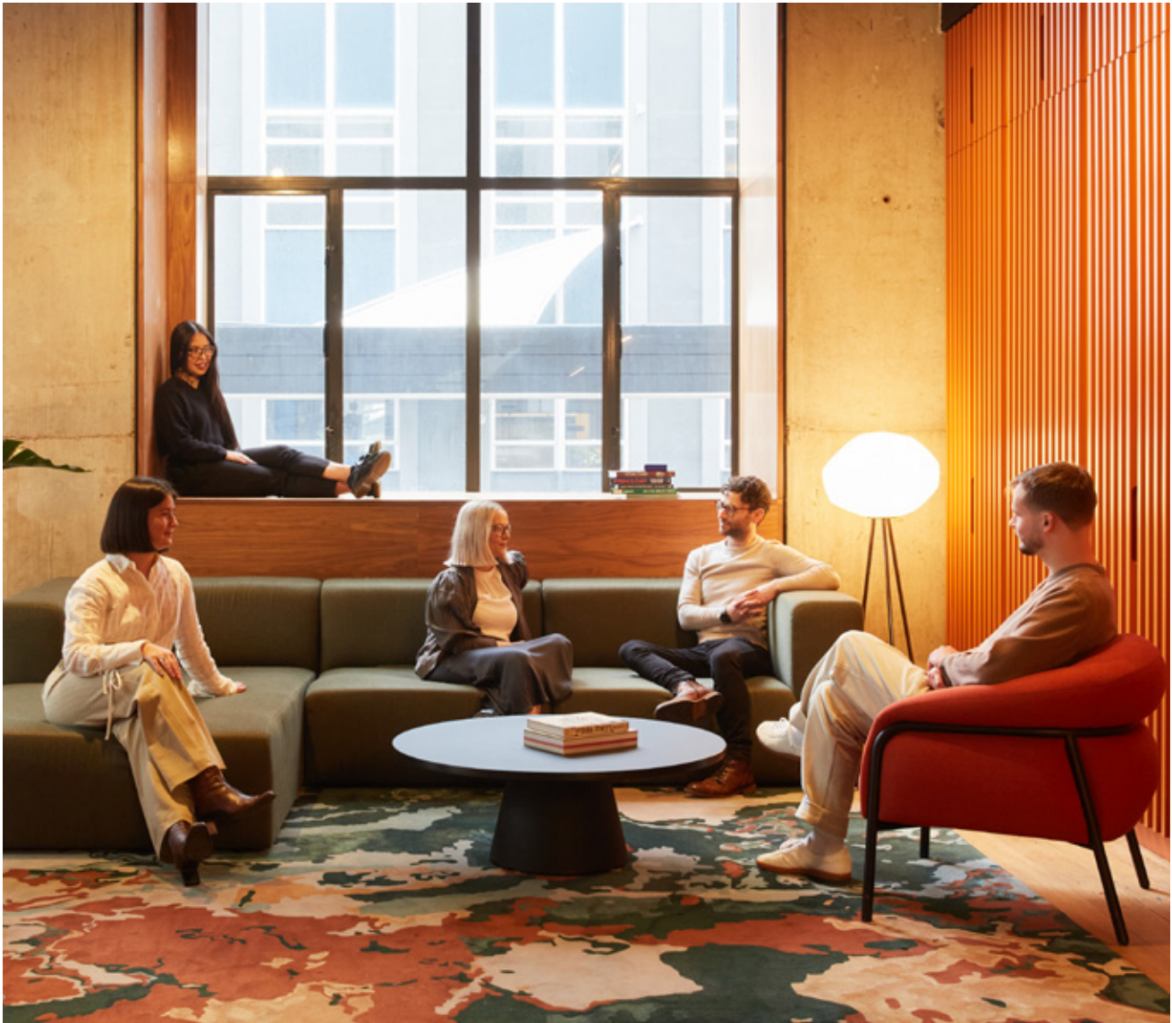
MEETING AND EVENT SPACES