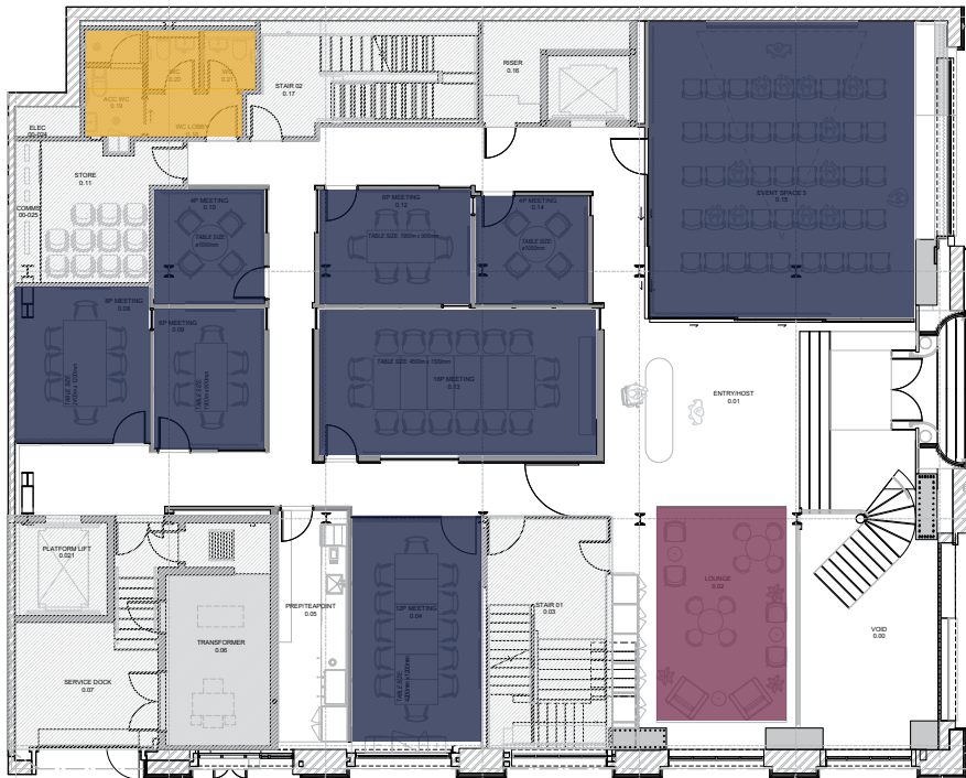
Ground Floor Entry & Host, Event & Meeting Rooms